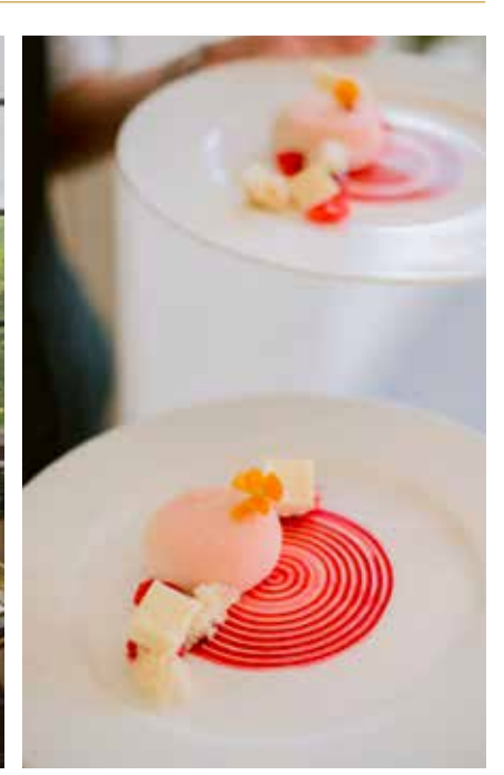
Your food is our passion. Our expert team of chefs will create the ultimate culinary experience to complement the grandeur of your day.